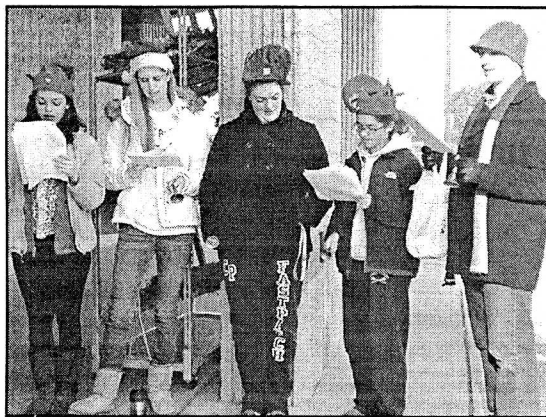
Carle Place Key Club members sing Christmas carols at the King Kullen supermarket in Mineola.