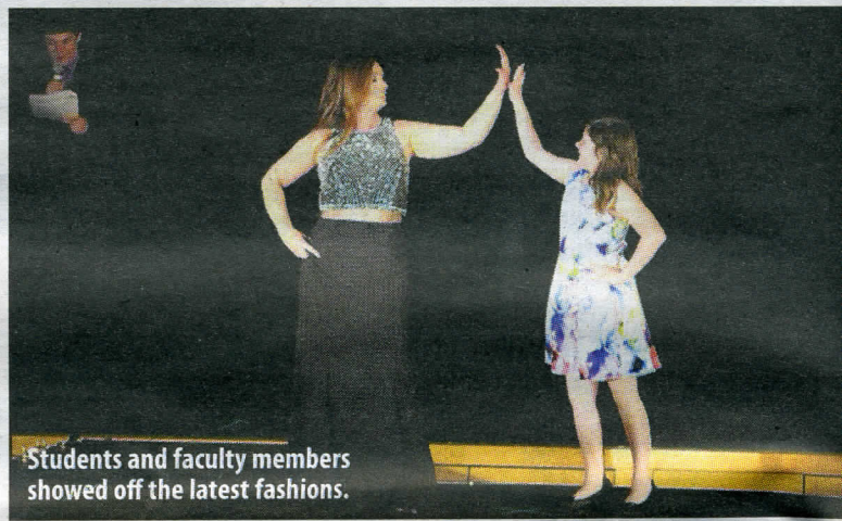
Students and faculty members showed off the latest fashions.