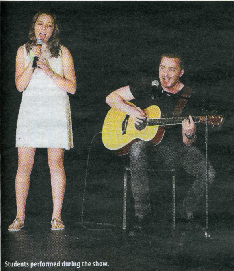
Students performed during the show.